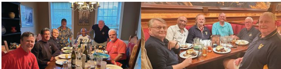
'78: Scenes from 1st Co Springfest