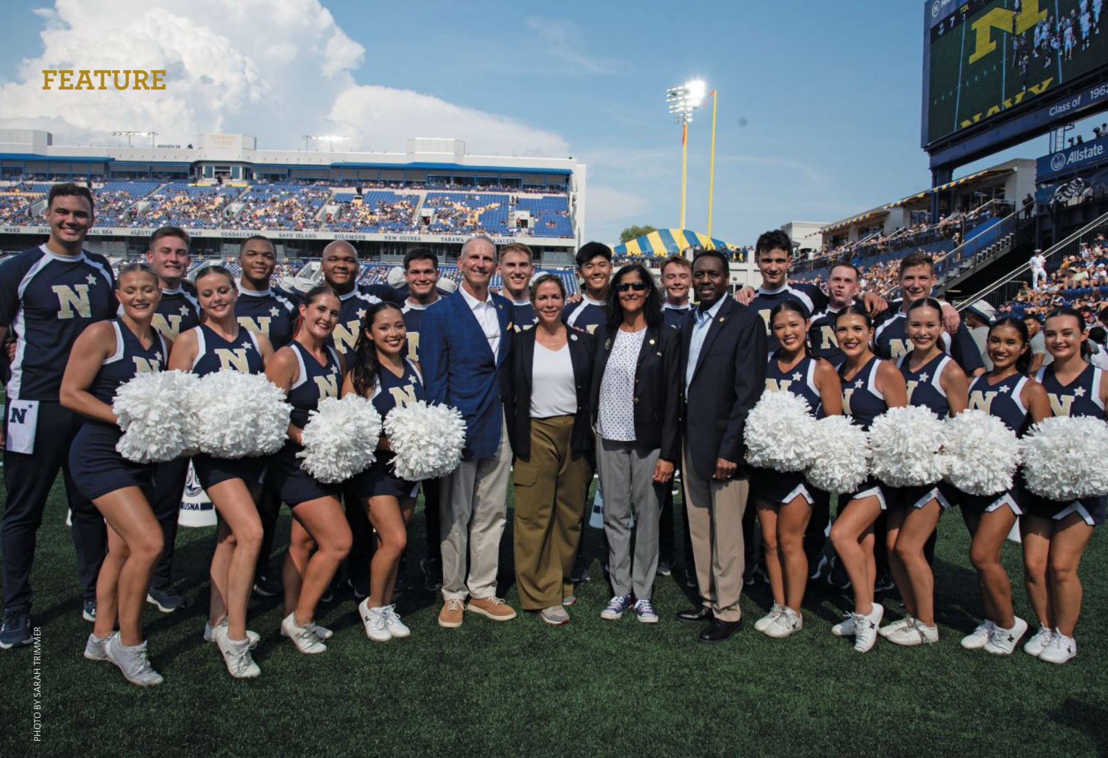
The U.S. Naval Academy Distinguished Graduates Class of 2025 were honored on 4 September in Alumni Hall and recognized on 6 September during Navy's victory over UAB at Navy-Marine Corps Memorial Stadium.