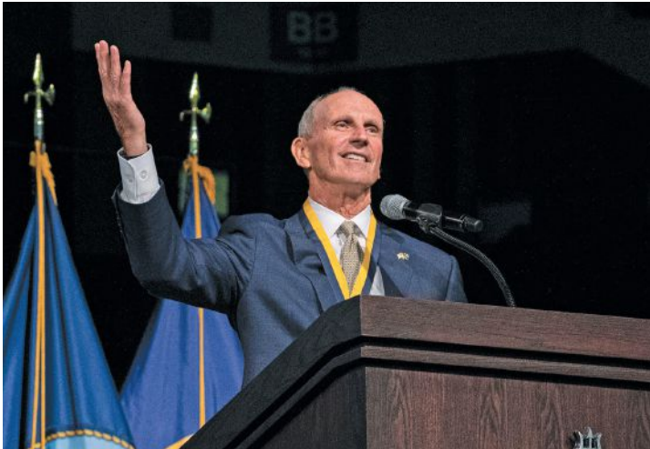
DGA CEREMONY PHOTOS