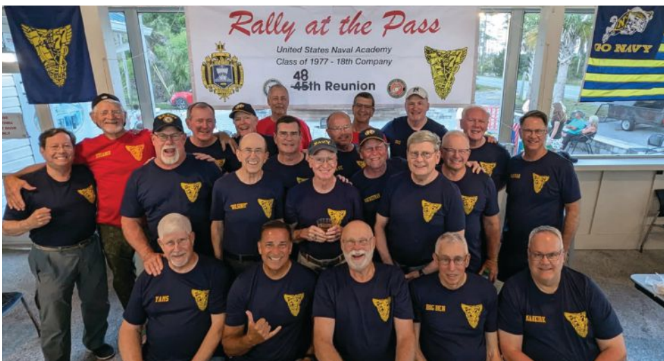
'77: 18th Company Skaters

First Company held their annual Springfest outing 30 April-5 May 2025, returning to