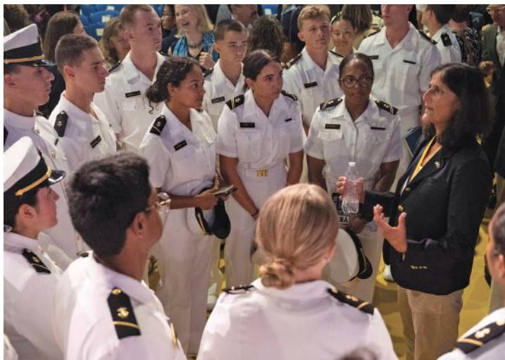
CAPT Sunita L. Williams '87, USN (Ret.), is one of two women to command the International Space Station twice. She has spent more than 500 days in space and is a regular participant at the Astronaut Convocation at the Naval Academy.

teamwork, humility, selflessness and leadership made a huge difference in getting me ready for my first mission.”