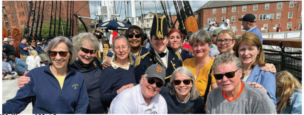
'80: Women of 80 at CONSTITUTION