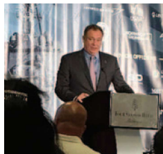
Mike Lopez-Alegria gives a great talk about Space at the Chairman's Banquet