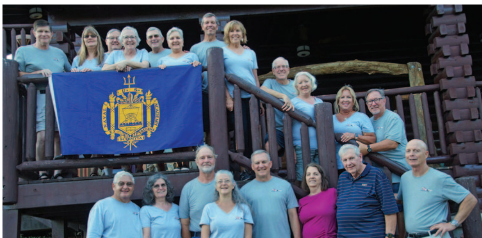
'78: 28th Mini Reunion