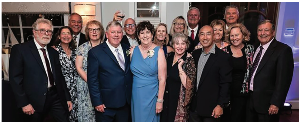
'78: Kalnoske Wedding