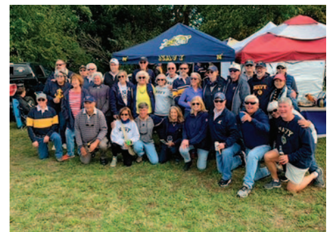
Navy vs Tulsa tailgater