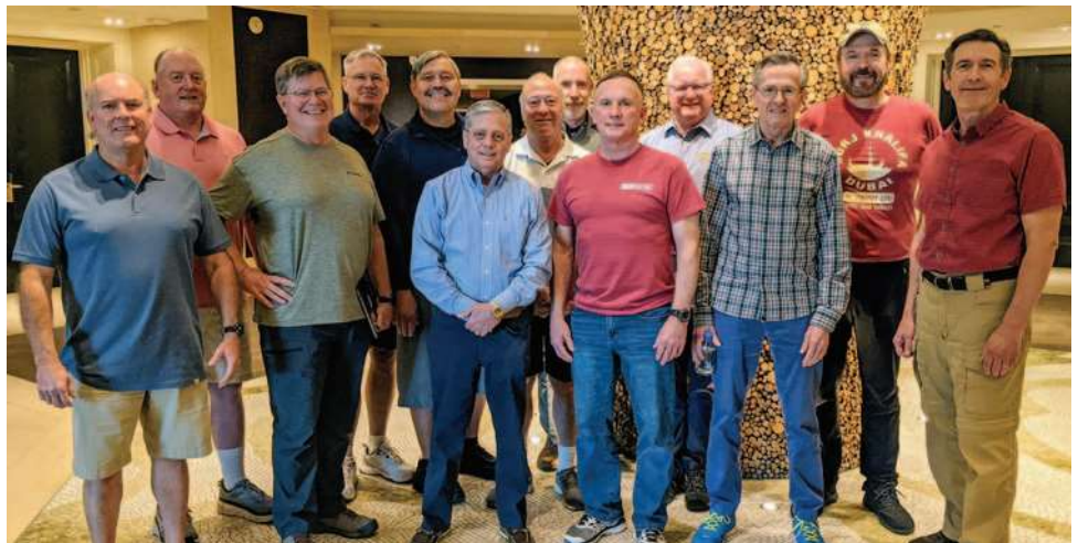
'79: 10th Company "mid-term reunion" in Las Vegas