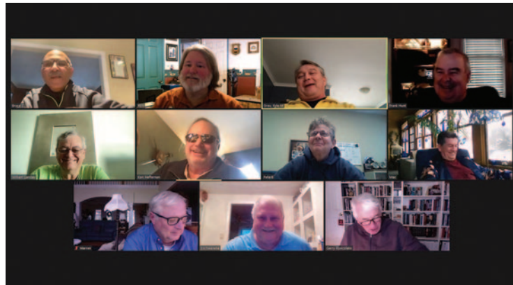
'78: 1st Company Zoom Call