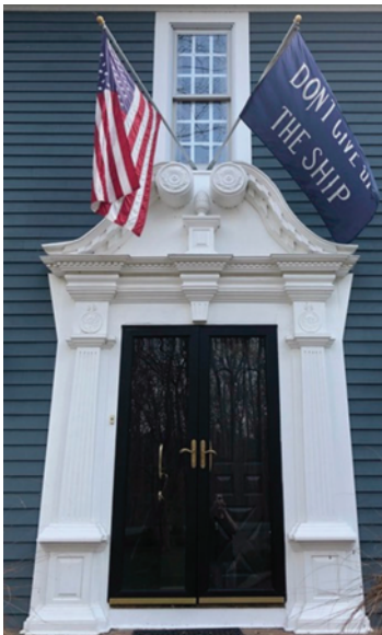
Don't Give Up The Ship

As an aside, we're proud to have a small replica of Perry's battle flag, which still hangs in Memorial Hall, flying over our front door: