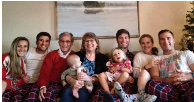
'78: The Fiorelli