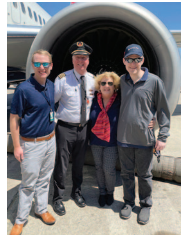
The Abeleins on Retirement Day