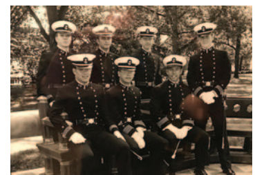
Fall 1978, first set Brigade Staff