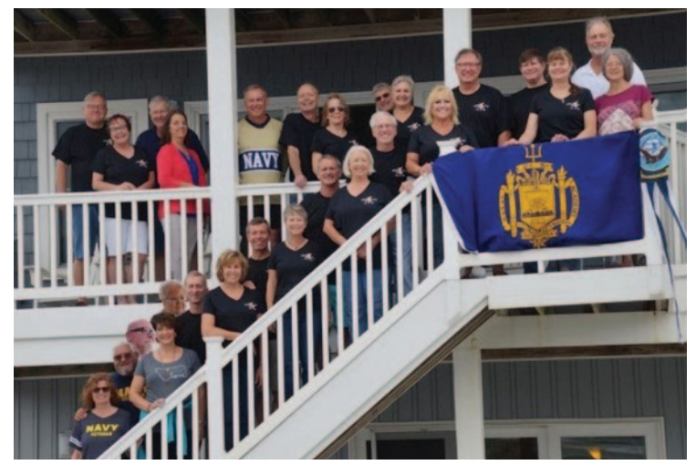
'78: 28th Co Mini-Reunion #8