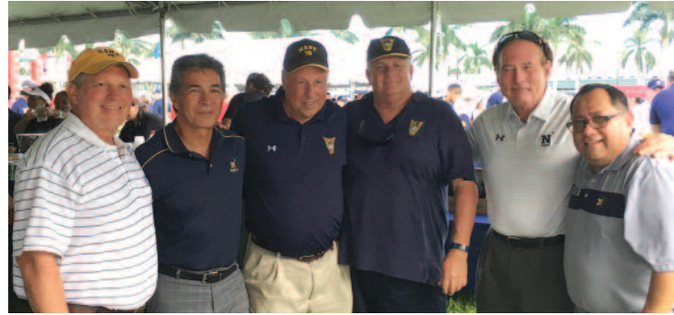
'78 at FAU Tailgate

Football season will soon be over when this comes out. This season started with a great victory in a marathon of a game against Florida