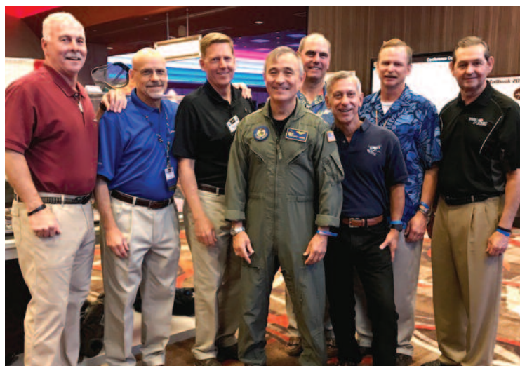
'78 at Tailhook 2017