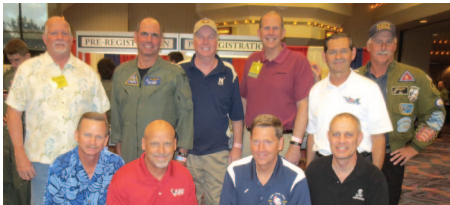
’78 at Tailhook 2014

Like many of you I attended my 40th high school reunion. I also got to visit family. Among them was my cousin,