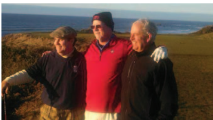
...another round above the ground; TRULY a cause for celebration!