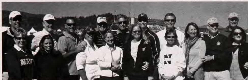
'78 at Navy- Air Force 2010