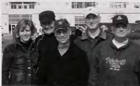
At the Navy Georgetown lacrosse game